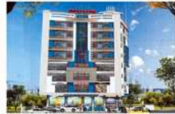
Western Heights, Shyam Nagar