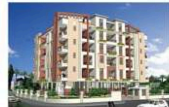
Vardhman Residency II, Kanak Vihar, Ajmer Road