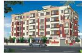
Vardhman Apartments, Banipark