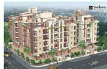
Vardhman Residency, Kanak Vihar, Ajmer Road